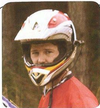
twenty 20 helmet camera $499.00